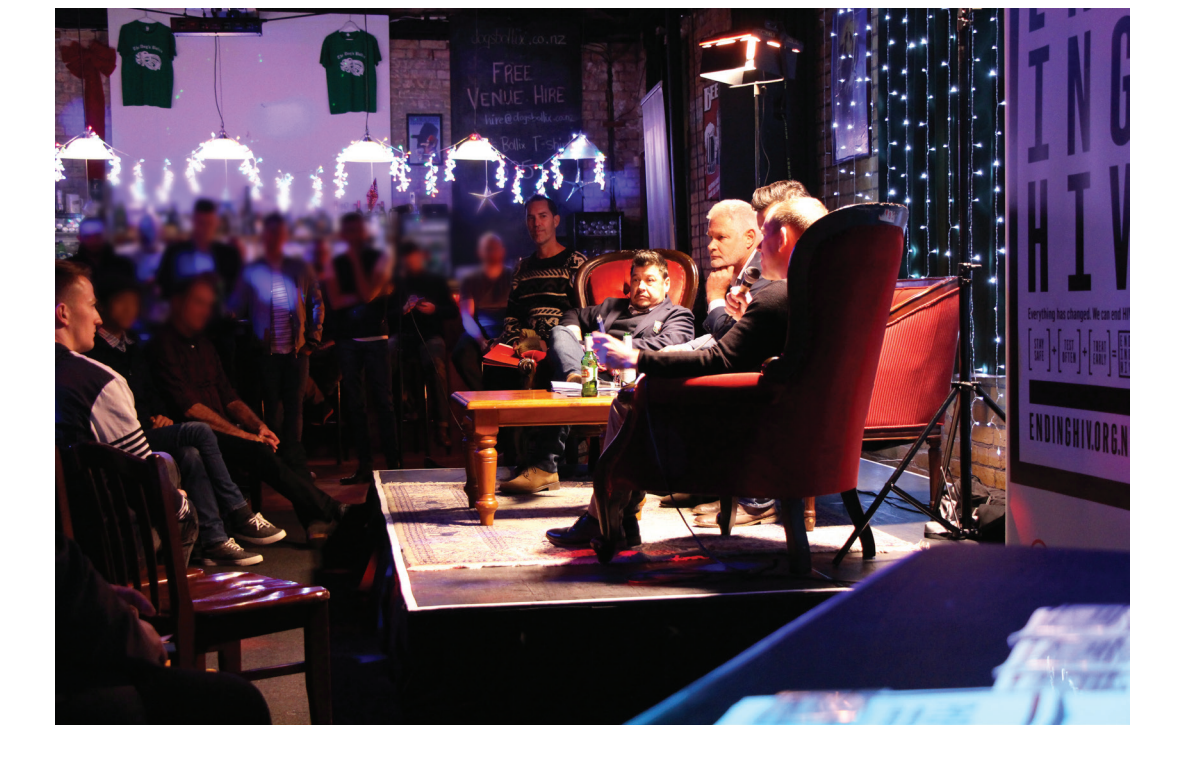
Figure 1. A PrEP Community Forum held in Auckland