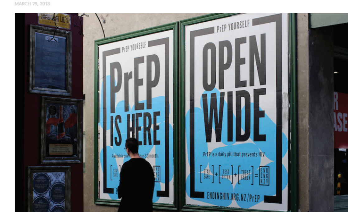
'A milestone step towards ending HIV': the truth about the PrEP funding decision